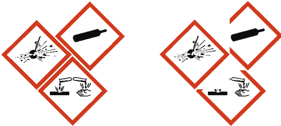
Figure 1: Support for transparent images (left) compared to the previous version (right)

When using images with transparency on the label, the images will be printed transparently on page printers (GDI printing). Also when printing transparent images on PostScript printers, the images will be printed correctly.