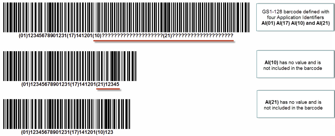
Figure 4: Application Identifier is not encoded in the GS1-128 barcode if it doesn't have any value

All of these data are encoded using the Application Identifiers. Each Application Identifier encodes a specific piece of information. Some GS1 barcode symbologies, such as GS1-128 and others, can encode many Application Identifiers in the same barcode.