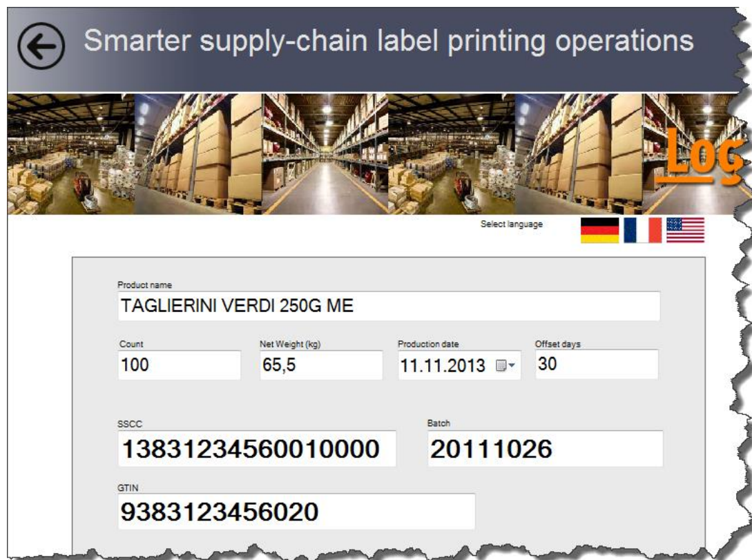
Figure 1: The application's UI running in the English language

The new Translate Form action updates the UI of the current form. You can execute it on any actionable object or event. Typically, you define a drop-down box with a list of available languages, or display country flags. A value change in the drop-down box or a click on a country flag changes the language of the application.