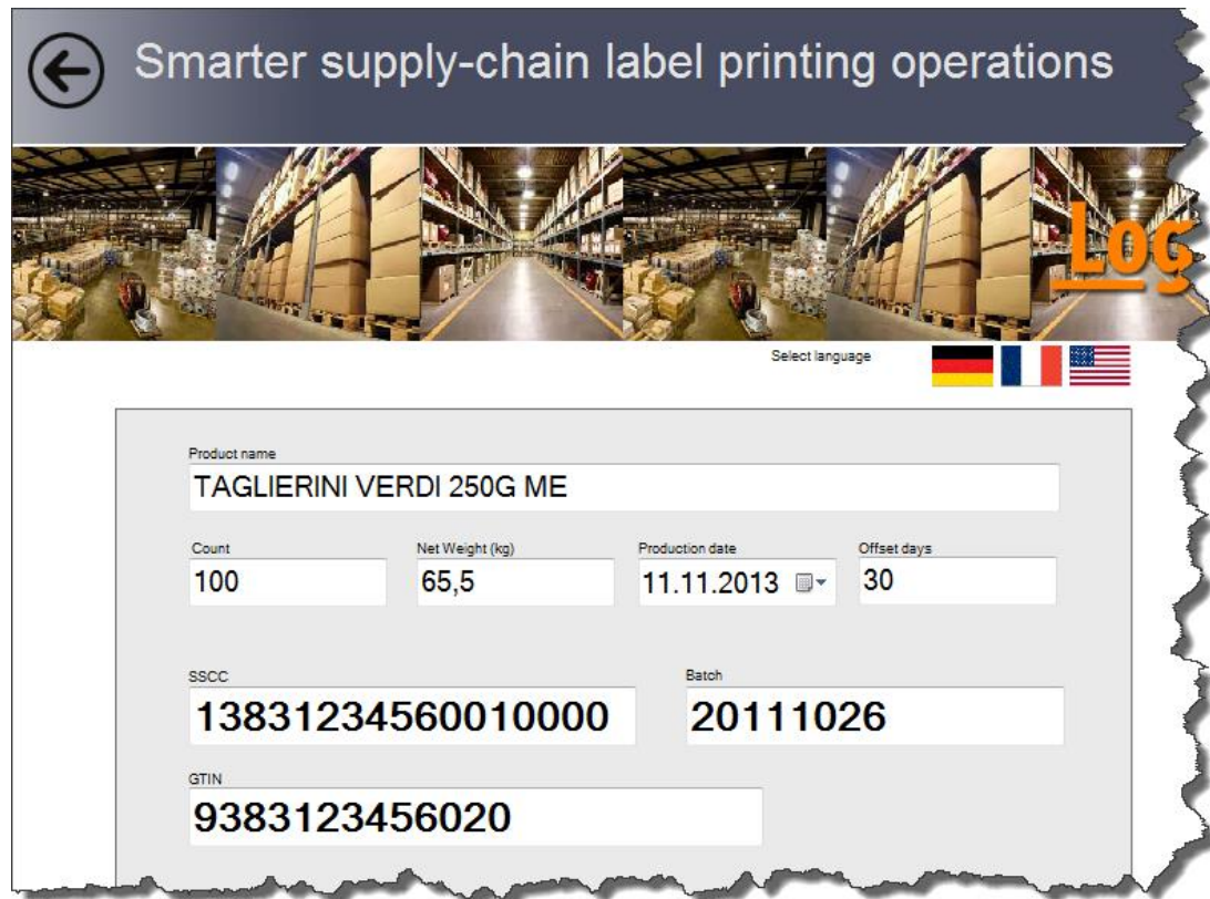
Figure 1: The application's UI running in the English language

The new Translate Form action updates the UI of the current form. You can execute it on any actionable object or event. Typically, you define a drop-down box with a list of available languages, or display country flags. A value change in the drop-down box or a click on a country flag changes the language of the application.